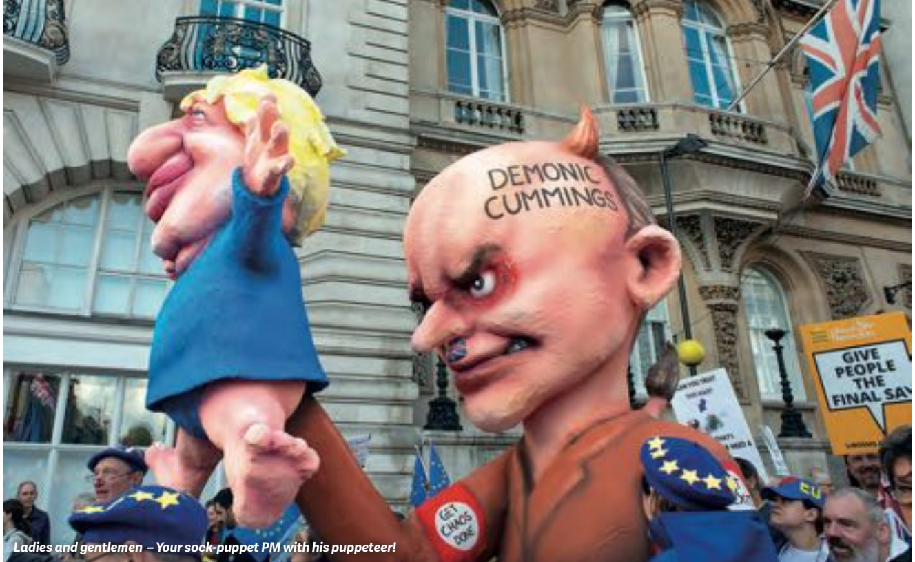
Ladies and gentlemen – Your sock-puppet PM with his puppeteer!

Here at iScot, we like to think we're doing our bit every month, keeping this fine magazine going and keeping supporting like-minded people in whatever it happens to be that they're doing to advance the cause. We'll keep on publishing articles that educate, inform and entertain. We'll promote Scottish history, culture and language. We'll air alternative views on topical subjects and explore what life could be like in an independent Scotland. Most of us don't want our newly independent state to be a watered-down version of Wastemonster, we want something far more democratic and egalitarian, so what could that look like? We'll explore constitutional and governance issues, currency, monetary policy, taxation, education, welfare, health and social care, renewable energy, international relations, and anything else that will support the modern version of our ancient nation. iScot Magazine consistently disproves the 'too wee, too poor, too stupid' trope beloved of the British Nationalists, and we'll continue to do that.