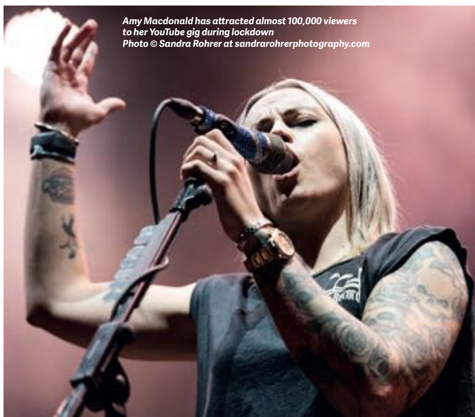
Amy Macdonald has attracted almost 100,000 viewers to her YouTube gig during lockdown