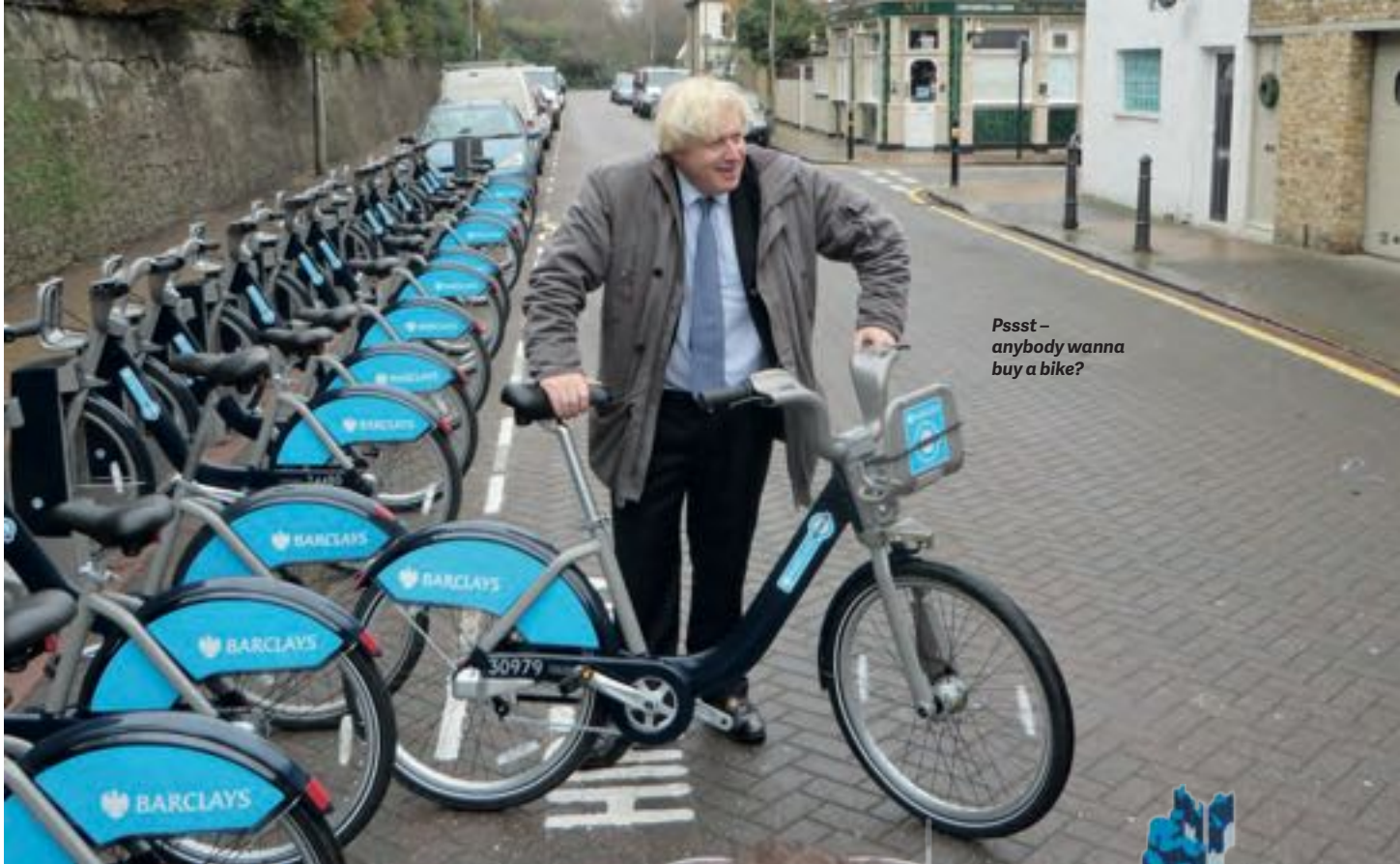
Pssst – anybody wanna buy a bike?