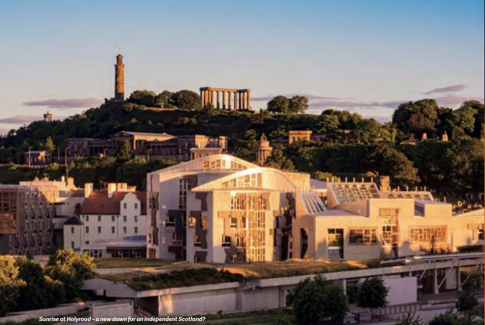
Sunrise at Holyrood – a new dawn for an independent Scotland?

personalities, timing, republicanism versus monarchy, EU and NATO membership, and countless others that haven't yet been dreamed up, either innocently or maliciously. Some of these will be genuine differences that will have to be debated and decided someday, others will be manufactured grievances by malevolent actors – I always say that if the British security services aren't involved, and haven't already infiltrated our movement, then they're not doing their job, and it would be extremely naive to believe otherwise. But the key consideration, irrespective of personal preferences in one aspect or another, is that we cannot even have any of those debates until we regain our independence. To me, the idea that "I'll not vote Yes if it means rejoining/leaving the EU", or "I'll only vote Yes if we're committed to a socialist republic", or "There's no point in voting Yes if that Growth Commission paper is still on the table", is as ridiculous as the people who, back in 2014 said "Ah cannae stand that Alex Salmond" or who now say the same of Nicola Sturgeon. I have enormous respect for both of those individuals, but they are only, to quote the late Robin Day, "here-today, gone-tomorrow politicians"! What we are all engaged in is a cause to return Scotland to its