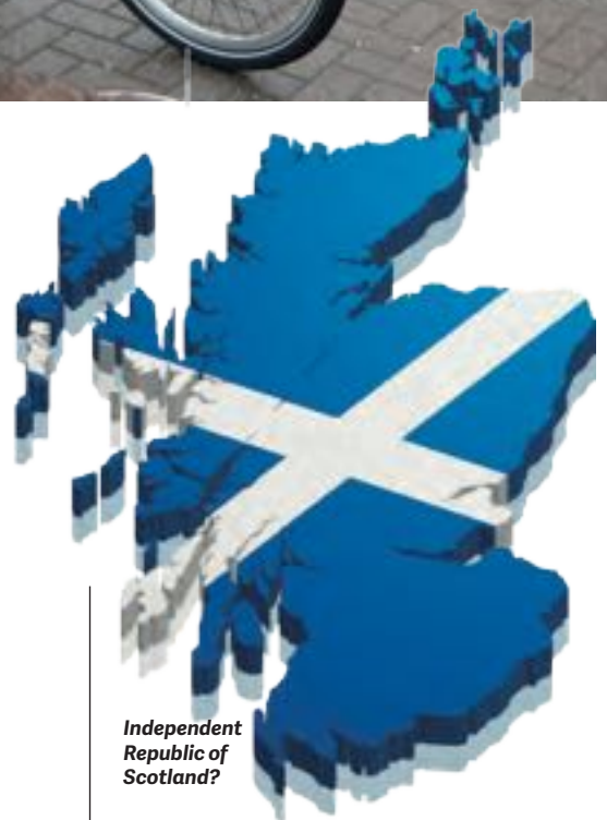
Independent Republic of Scotland?

I take the view that both sides are correct, and that is not to sit on the fence but to be realistic about the situation we're currently in. The Scottish Government