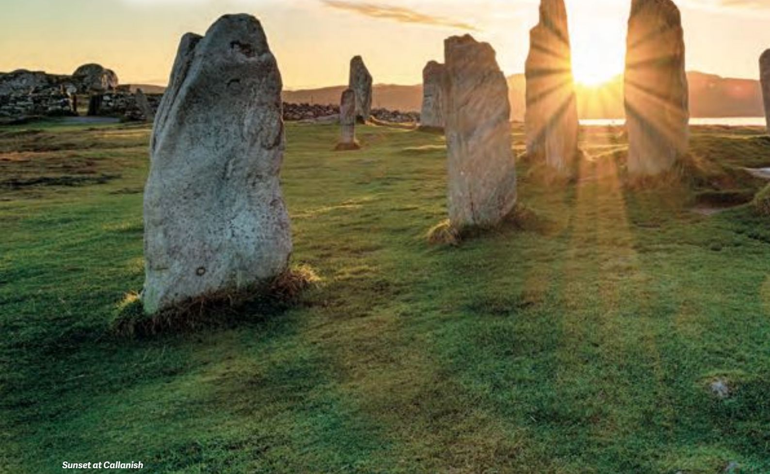
Sunset at Callanish